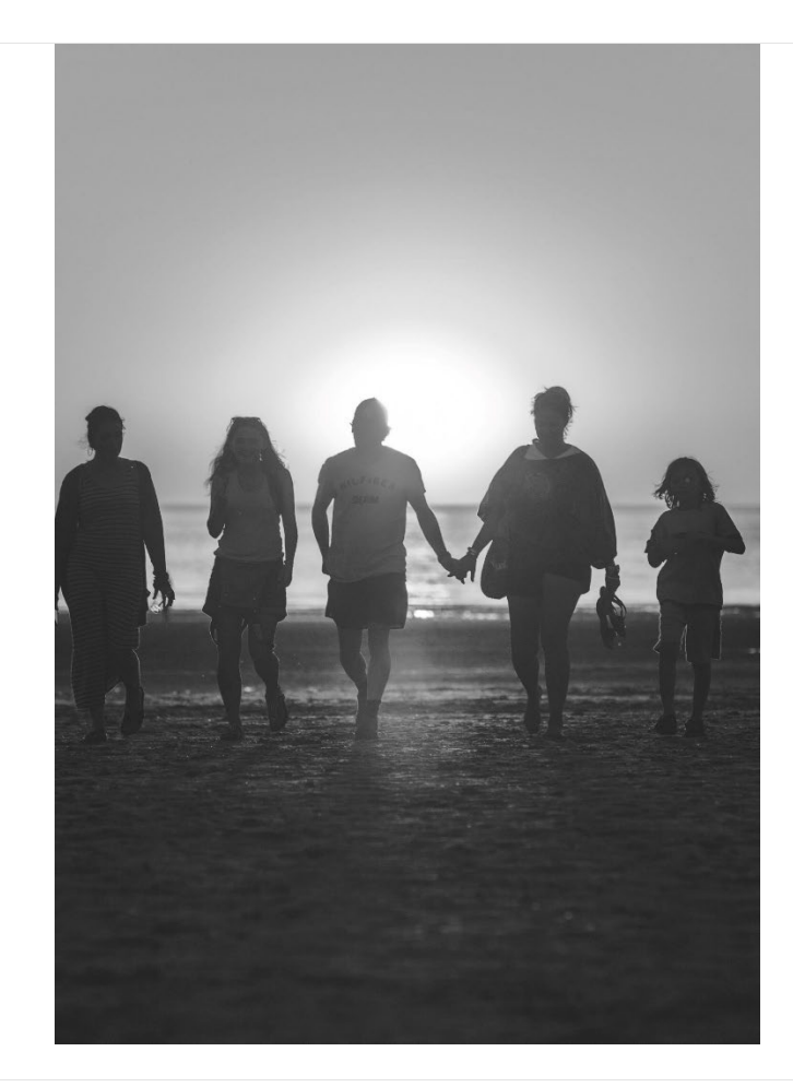
Remember to practice regularly for best results & share liberally with family & friends.